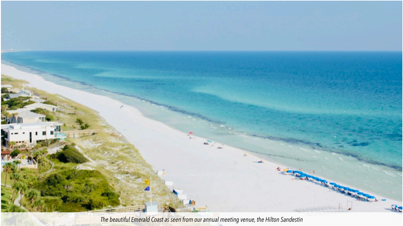
The beautiful Emerald Coast as seen from our annual meeting venue, the Hilton Sandestin

46th Annual Review of Dentistry - Destin, FL (continued)