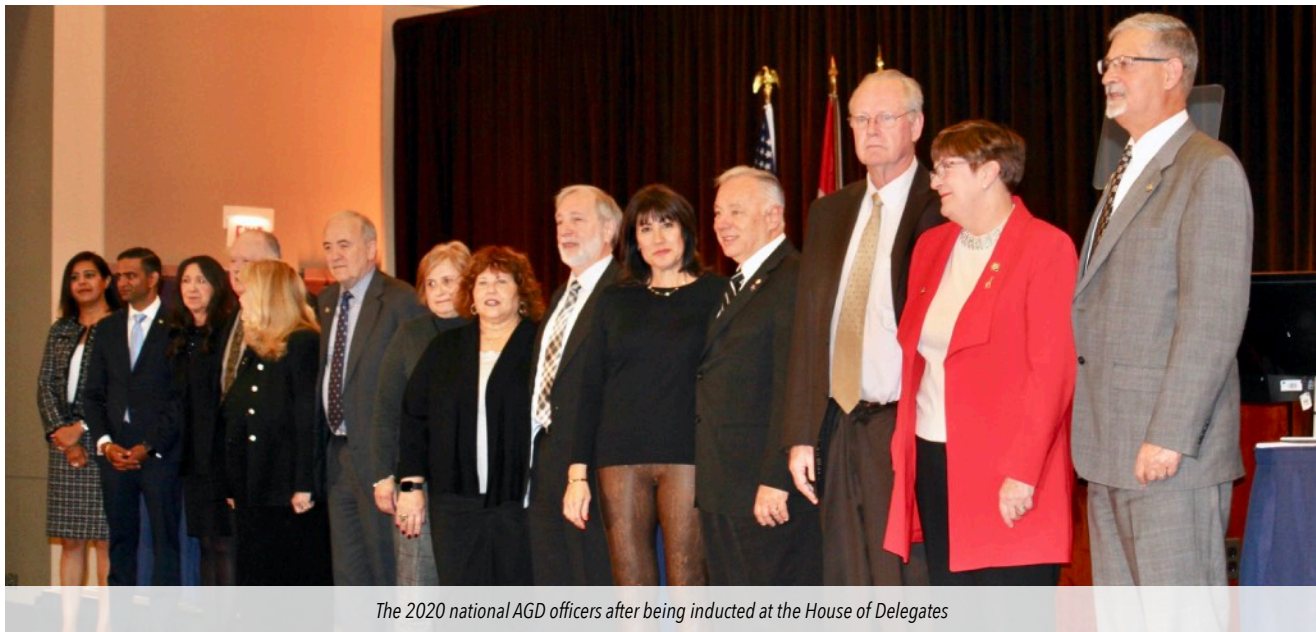
The 2020 national AGD officers after being inducted at the House of Delegates