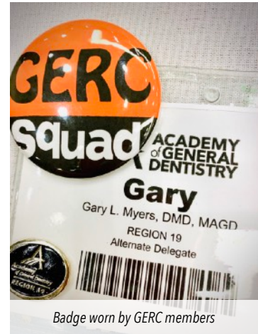
Badge worn by GERC members