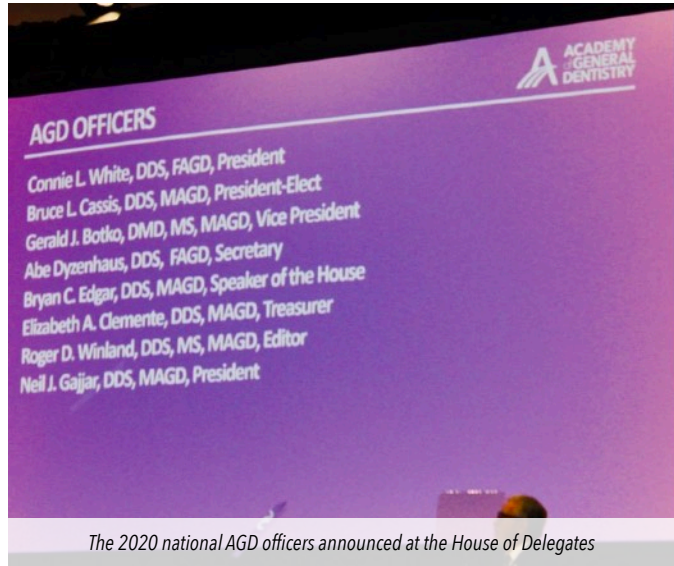
The 2020 national AGD officers announced at the House of Delegates