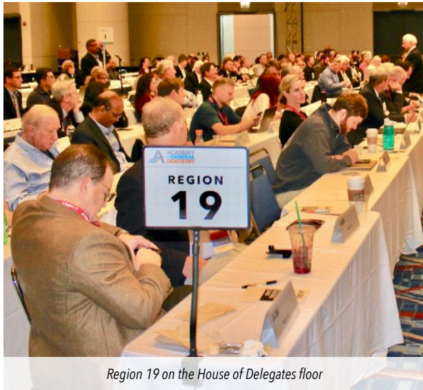
Region 19 on the House of Delegates floor