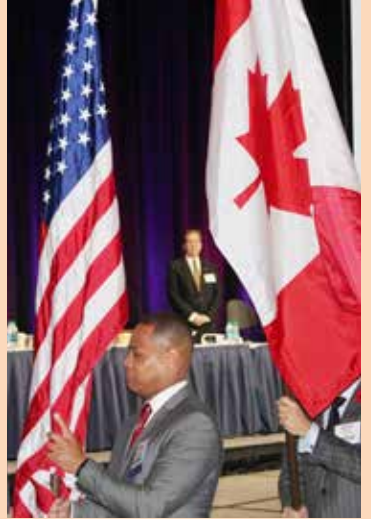
Posting of the Colors opens the 2017 Annual Meeting of the House of Delegates.