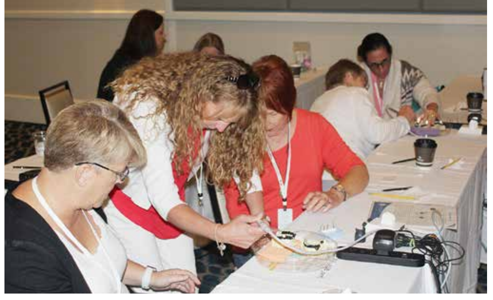
Hands on instruction for Hygienists.