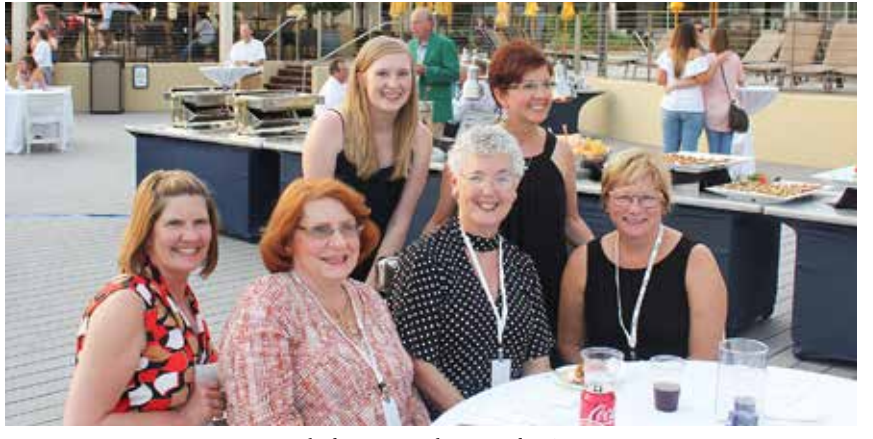
Pretty ladies enjoy the President's Party.