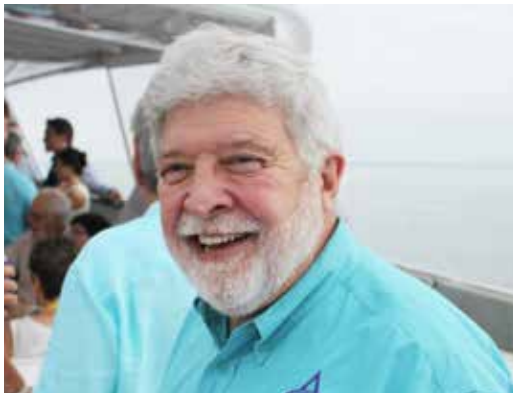
ALAGD President enjoys the outing on the Oral Arts yacht.