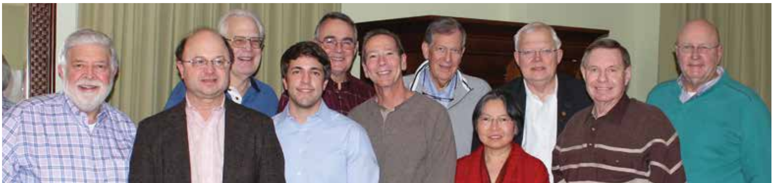
January Officers and Board members attend a Strategic Planning Meeting in Destin.