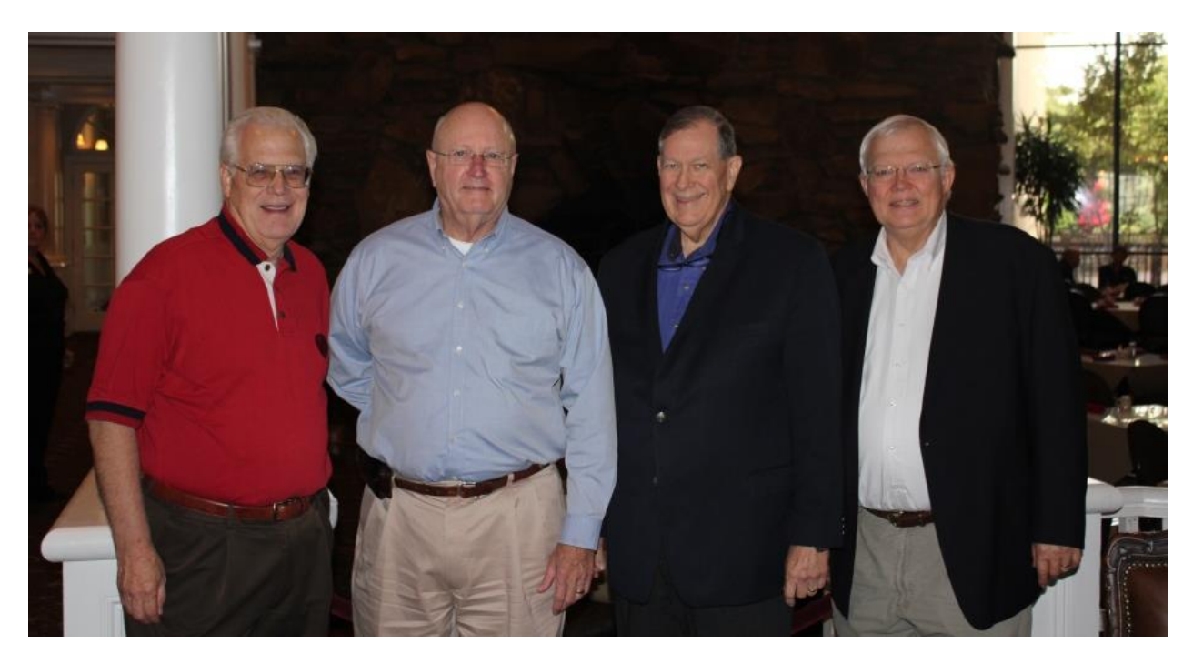
2014 ALAGD Delegation at the 2014 AGD Annual Meetng in Detroit.